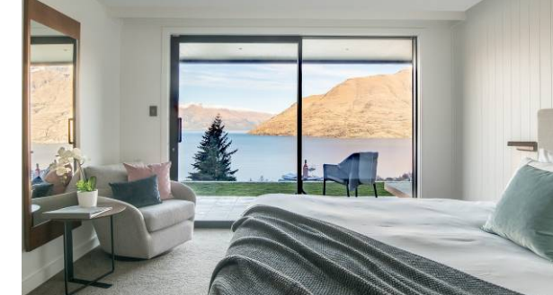
Kamana Lakehouse and Site for new building